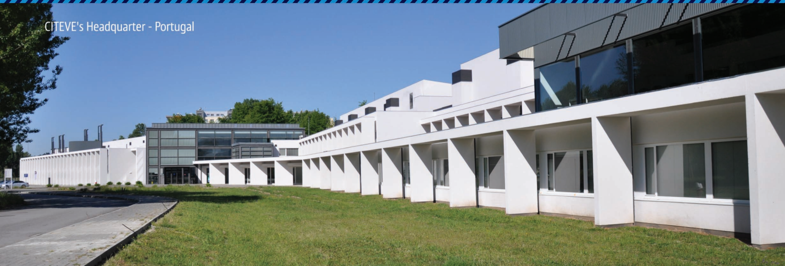
CITEVE's Headquarter - Portugal

| PORTUGAL | BRASIL | TUNISIE | ARGENTINA | | PAKISTAN | CHILE | MÉXICO |